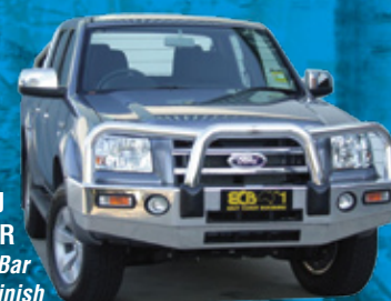
RANGER PJ BIG TUBE BAR Bumper Over Bar Mirror Polished Finish