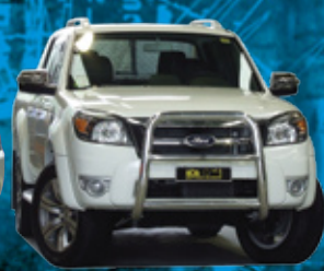
RANGER PK WILDTRAK Mirror Polished Finish