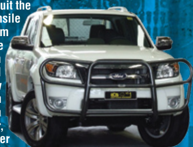
RANGER PK WILDTRAK Silver Hammer tone Finish