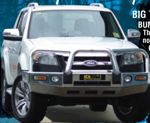
RANGER PK WILDTRAK BIG TUBE BAR Bumper Replacement Bar Mirror Polished Finish