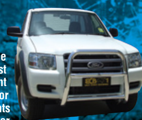
RANGER PJ Mirror Polished Finish

This very stylish 63mm Series 2 Nudge Bar is great for those around town nudges and bumps which can be costly to the bumper and also the cooling equipment just inside. A large opening and a spotlight mounting tabs make an ideal location for extra lighting. Utilising solid steel mounts and available in Mirror Polished or Powdercoated Alloy, this protection system is very functional while being stylish and attractive.