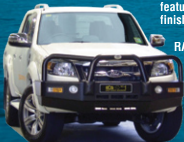
RANGER PK WILDTRAK BIG TUBE BAR Bumper Over Bar Black Ripple Finish