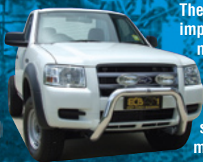
RANGER PJ Mirror Polished Finish

Contact the ECB National Customer Service Centre for your local ECB Outlet