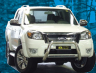
RANGER PK WILDTRAK Mirror Polished Finish

This nudge bar is made from 76mm x 4.7mm Structural Grade Alloy, ensuring strength and will never rust compared to much thinner sectioned stainless steel products which do not offer the strength, protection nor durability of a genuine ECB product.