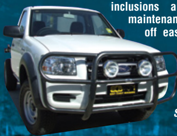
RANGER PJ Silver Hammer tone Finish

The tubular construction of the Type 8 Bar contours perfectly to suit the Ranger's aerodynamic styling. Manufactured from high tensile alloys with a 63mm centre tube, the Type 8 Bar provides optimum frontal protection for the bumper, grille, headlights and the delicate intercooler while a steel mounting system ensures a strong fitment. Driving light mounting provisions are standard inclusions and for a superior low maintenance finish where bugs wash off easily, why not choose from ECB's range of superior, low maintenance powder coated finishes?